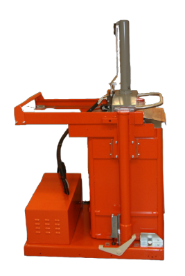
Mounted on wheels for easy manoeuvring when cleaning