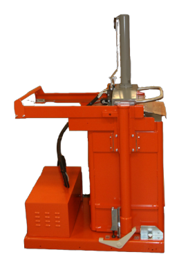
Mounted on wheels for easy manoeuvring when cleaning