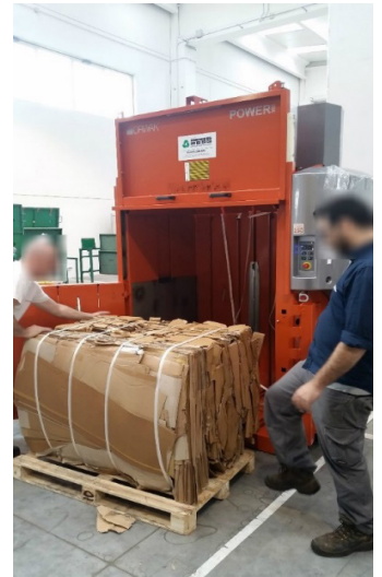
Here it is! The 450 kg cardboard bale!

This choice was based on the great technical features and the very low noise level of this model.