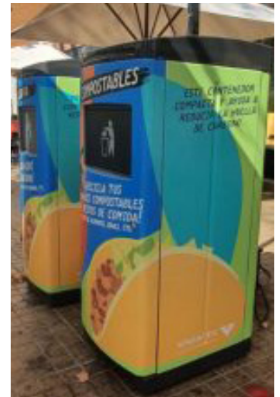
Compaction ratio 8 to 1