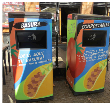
TOM in colorful customized wrappings