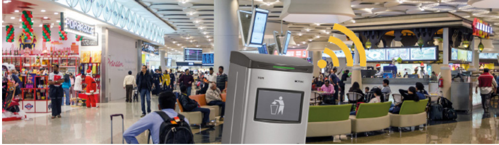
TOM CONNECT M2M communication service!