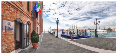
A beautiful venue on Giudecca Island

The new dutiful partner, 3115 from Orwak is well-received by the staff