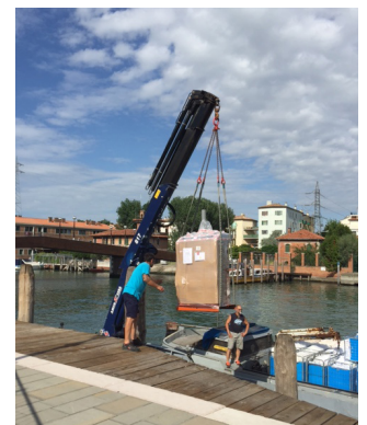
The Orwak baler is lifted ashore on the island