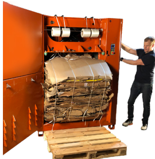
Simply push two buttons for bale ejection!

The baler is fast and with a cycle time of just 16 sec, it is ready for a new load of cardboard boxes or plastic foil in no time and auto start is a standard feature! 3220 can be operated manually but is preferably run in auto mode for maximum productivity and convenience.