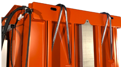
Pipes for easy bale strapping