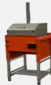
The single-chamber unit with swing door

The compactor is easily extended with additional chambers. The front door on the single-chamber unit is then replaced by an apron for effortless movement of the press head from one chamber to the next.