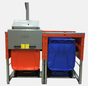
The multiple-chamber unit equipped with an apron with two handles