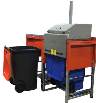
Designed to fit the standard 96 gal bins in the market.

Safety and quality are our hallmarks and the compactor provides maximum personal safety both for the operator and those in the immediate vicinity. A bin indicator assures that the machine can only start, when the bin is in the right position.