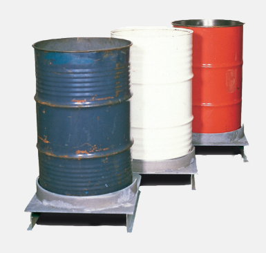
Standard drums can be used for storage and transport of the hazardous waste. Sorting is possible by using several drums.

It is easy to feed material into the open top-loading unit. The compactor is safe and simple to operate.