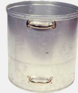
Optional steel container for safe handling of, for example, tins and glass after compaction.