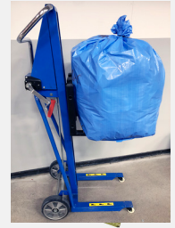
A simple-to-use option – the Orwak bale/bag lifter. Eliminates manual heavy lifting.