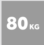
BALE WEIGHT CARDBOARD