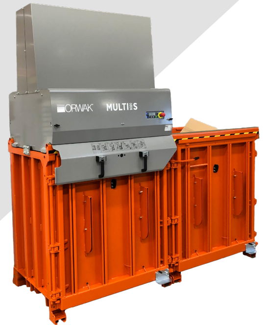
BALE WEIGHT CARDBOARD