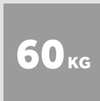
BALE WEIGHT CARDBOARD