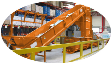
Option: conveyor belt

A completely automated waste management solution designed for continuous infeed, automatic horizontal or vertical strapping system with adjustable wire links, which enables you to yield optimal output.