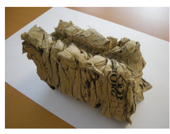
Small and compact briquette