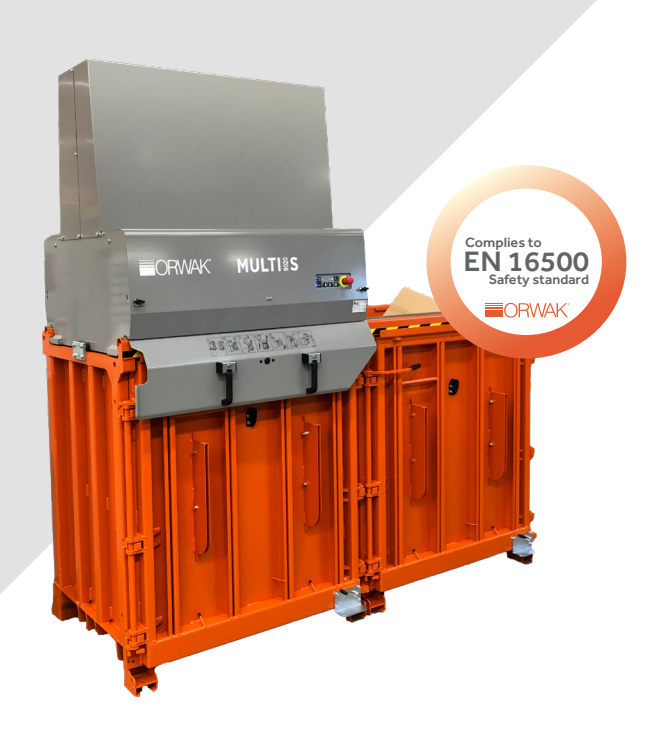
BALE WEIGHT CARDBOARD