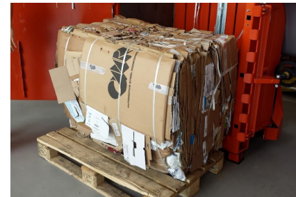
The new Orwak solution: efficient compaction and baling

"In short, we are very satisfied with the newly installed machines!"